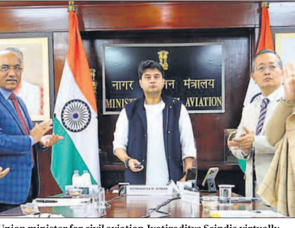
Union minister for civil aviation Jyotiraditya Scindia virtually inaugurated the terminal building (Phase-2) at Jolly Grant Airport in Dehradun on Wednesday.

Dhami said in the second phase, the terminal of Jolly Grant Airport has been expanded by 14,000 square metres. "Now the total expansion of the airport terminal has