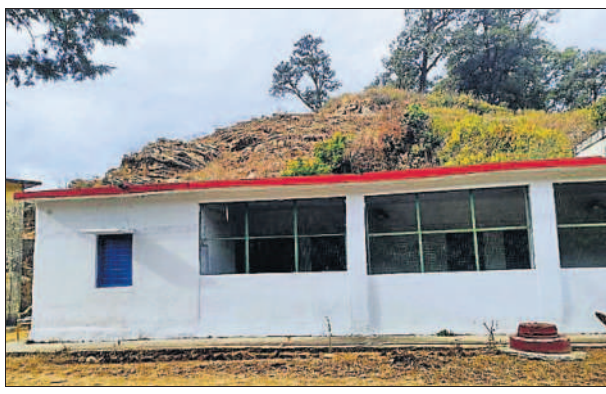
A closed down government school in Pithoragarh district.