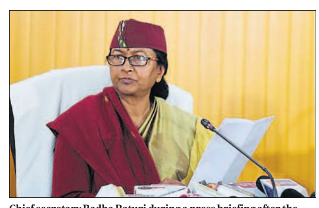
Chief secretary Radha Raturi during a press briefing after the cabinet meeting in Dehradun on Wednesday.

The new excise policy has made a provision for establishment of micro-distillation units